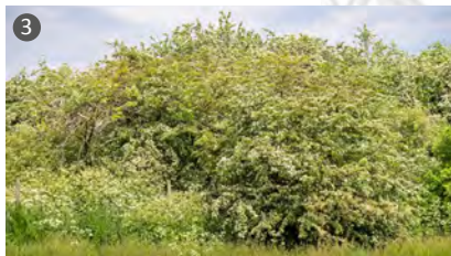
3 Dense scrub