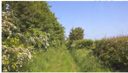
2 Species-rich hedgerows