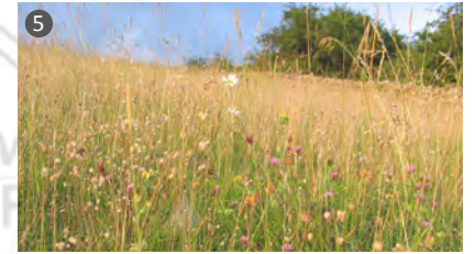
5 Hay meadow