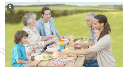
8 Viewpoint and picnic area