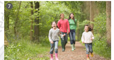
7 Pathway through woodland