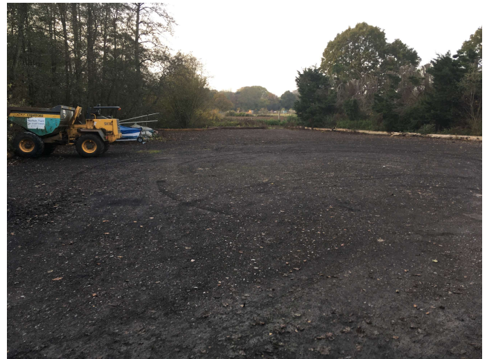
Office parking area