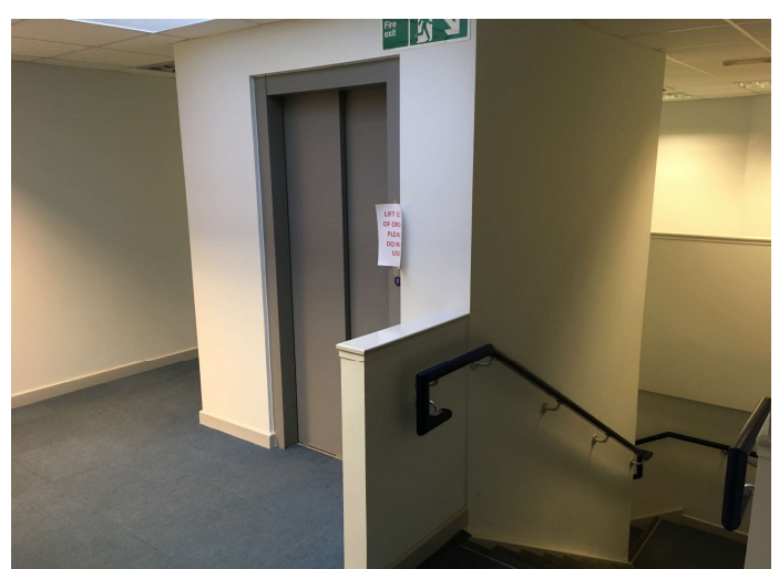
Lift on the first floor