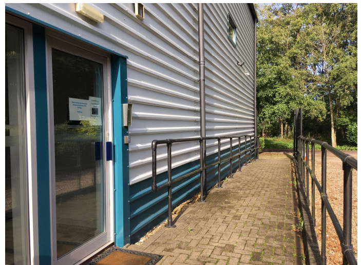
Ramp access to the office