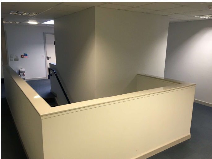
First floor landing