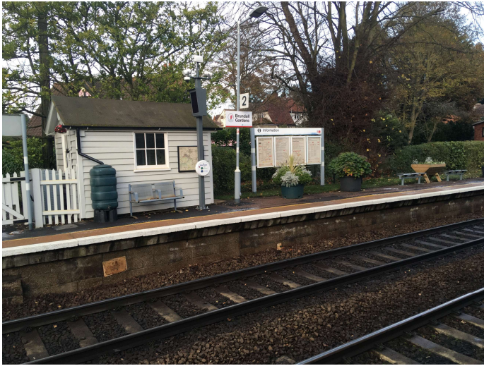
Brundall Gardens train station