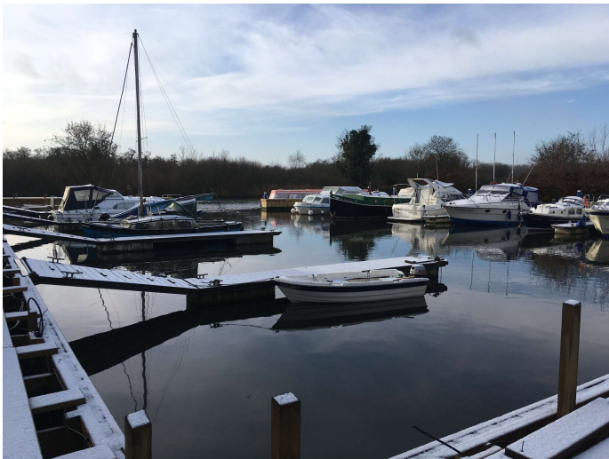
Boats at the marina