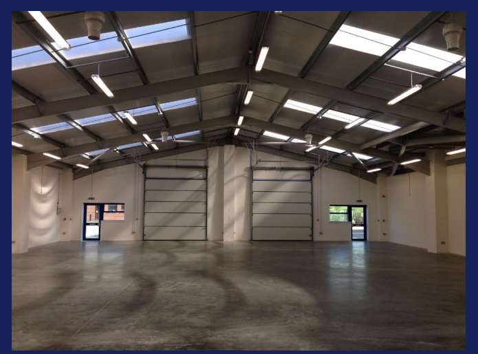
Warehouse prior to occupation