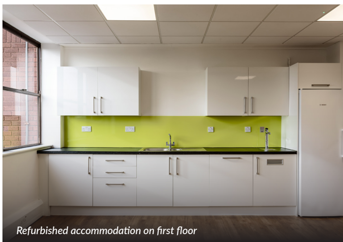
Refurbished accommodation on first floor