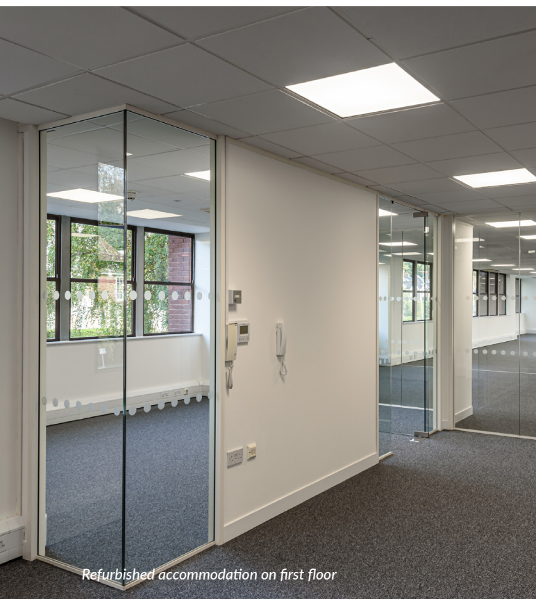
Refurbished accommodation on first floor