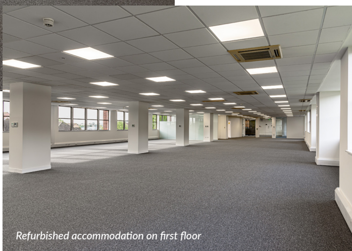
Refurbished accommodation on first floor

Available individually or as a whole. The first floor suites can be combined to provide 7,133 sq ft ( 662.67 sq m) with 20 spaces