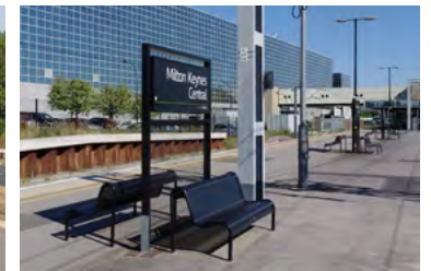
Milton Keynes Central - 3 miles

DISCLAIMER: The Agents for themselves and for the vendors or lessors of the property whose agents they are give notice that, (i) these particulars are given without responsibility of The Agents or the Vendors or Lessors as a general outline only, for the guidance of prospective purchasers or tenants, and do not constitute the whole or any part of an offer or contract; (ii) The Agents cannot guarantee the accuracy of any description, dimension, references to condition, necessary permissions for use and occupation and other details contained herein and any prospective purchasers or tenants should not rely on them as statements or representations of fact but must satisfy themselves by inspection or otherwise as to the accuracy of each of them; (iii) no employee of The Agents has any authority to make or give any representation or enter into any contract whatsoever in relation to the property; (iv) VAT may be payable on the purchase price and / or rent, all figures are exclusive of VAT, intending purchasers or lessees must satisfy themselves as to the applicable VAT position, if necessary by taking appropriate professional advice; (v) The Agents will not be liable, in negligence or otherwise, for any loss arising from the use of these particulars. 10.16.