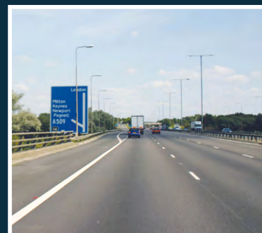
5 mins to M1 (J14)