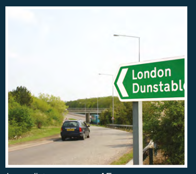
Immediate access to A5