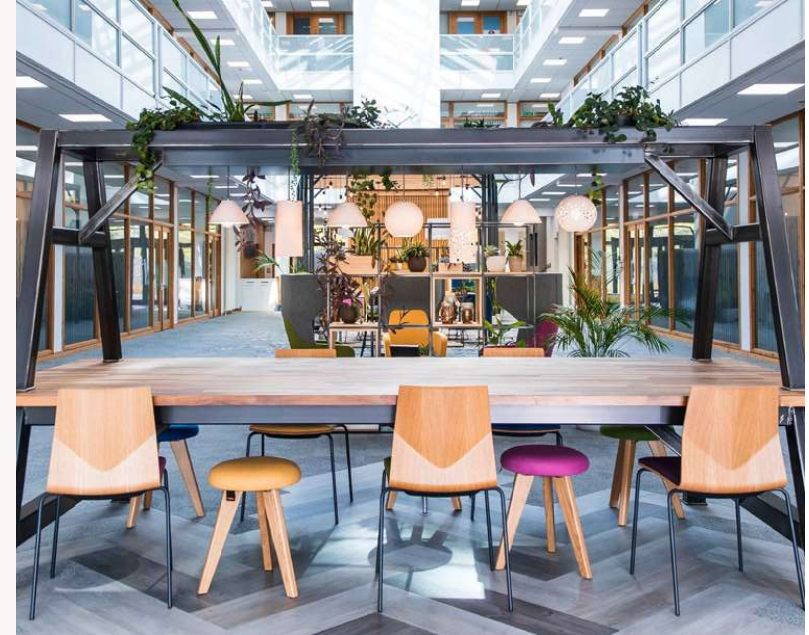
Top: overlooking the pond at Warren Park; bottom: café and communal meeting spaces at Shenley Pavilions.