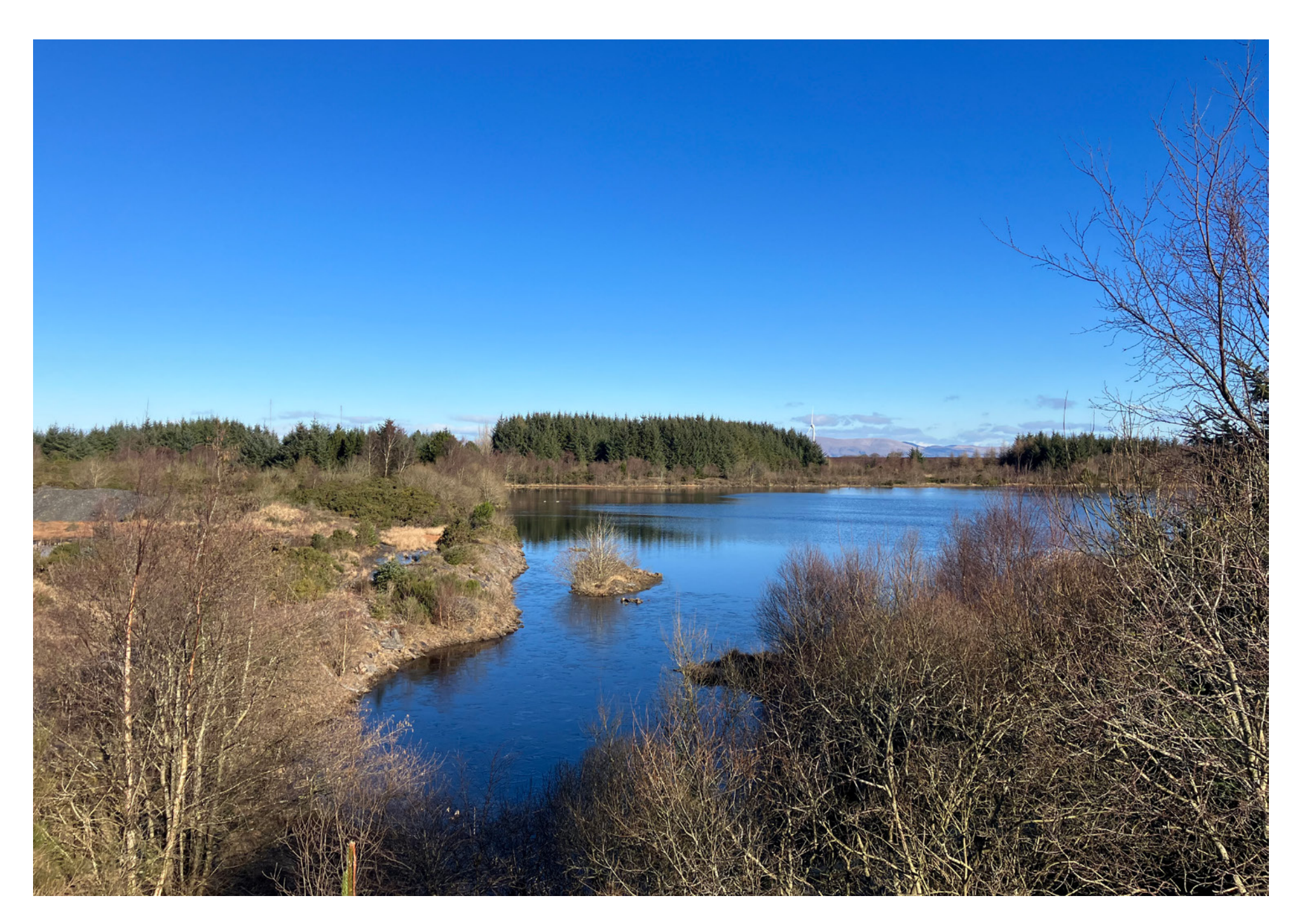
Photo taken March 2023. Access for service connection to the pond will be granted if required