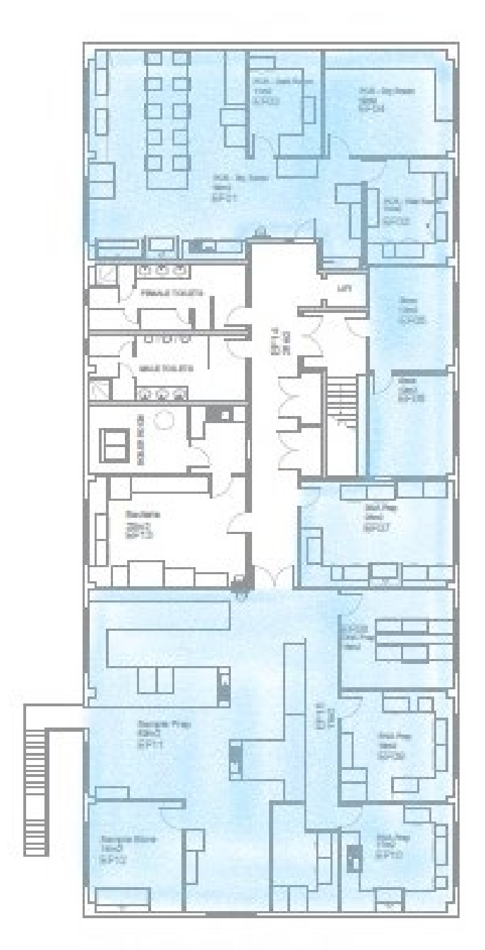
EAST WING FIRST FLOOR