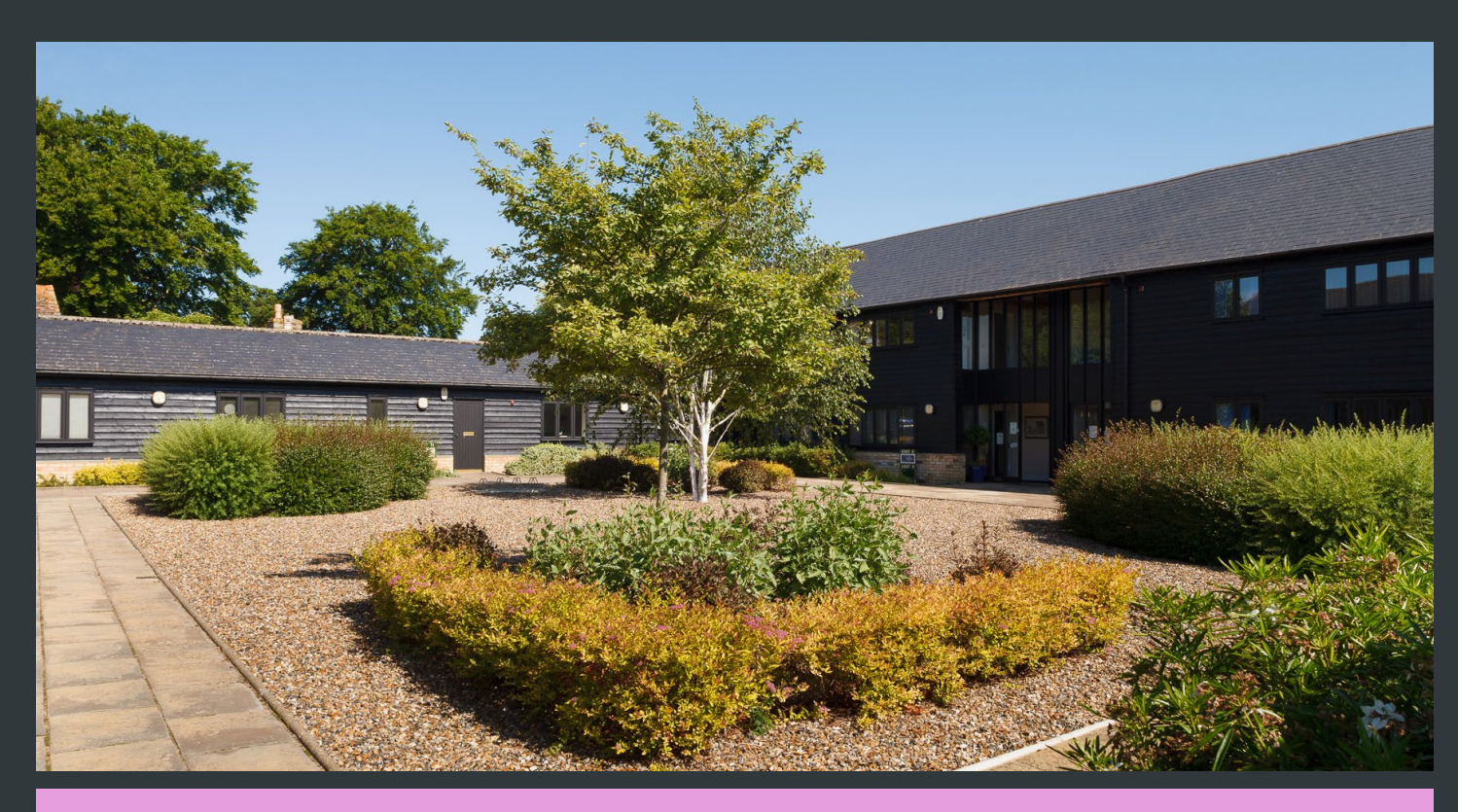
Magog Court: An established and popular location for organisations working in healthcare & life science.

Located on Babraham Road, Magog Court is ideally positioned just south of Cambridge city, within easy reach of Addenbrookes, Cambridge Biomedical Campus and the Babraham Research Campus. The former farmyard and associated buildings have been sensitively transformed into offices whilst retaining the character and heritage of the original site. Today, the attractive traditional weather boarding and Cambridge Stock Brick construction of the buildings converted to date blends blend in harmoniously with the surrounding rural area.