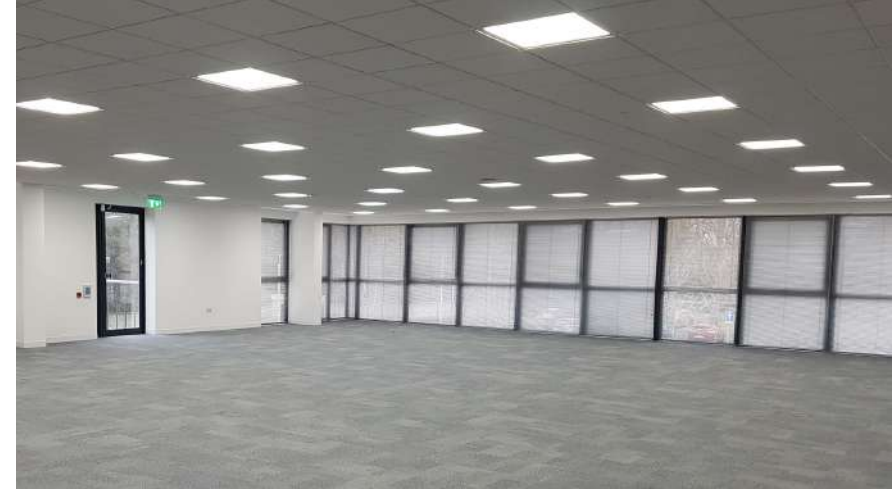
Indicative images - office suite and reception undergoing refurbishment