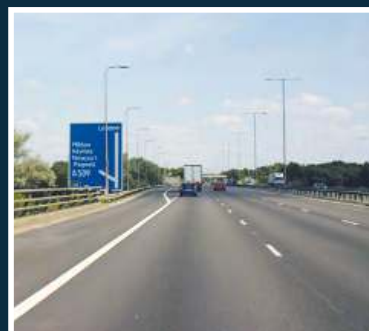
5 mins to M1 (J14)