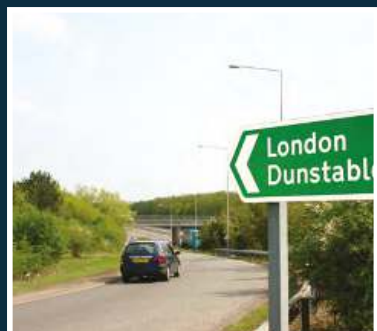
Immediate access to A5

For further information or to arrange a viewing, please call: