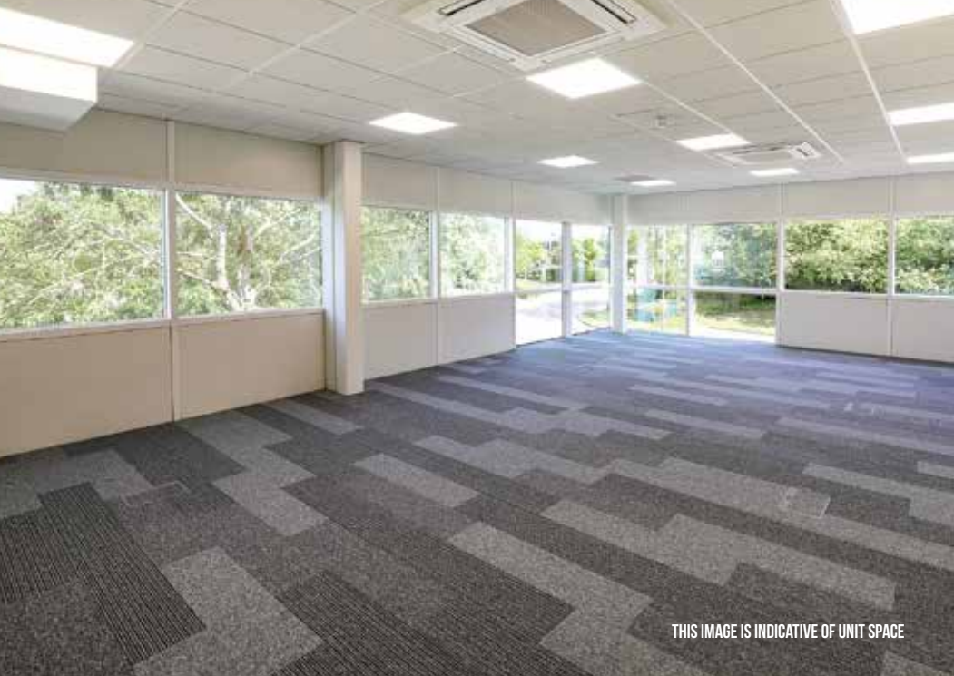
THIS IMAGE IS INDICATIVE OF UNIT SPACE