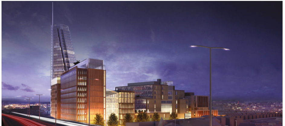
IMPERIAL COLLEGE THINKSPACE

Rental differentials will benefit the Golden Triangle as it competes for international R&D business, although strong demand, low vacancy rates and Green Belt limited growth suggest that rents across the Golden Triangle will rise in coming years.